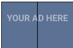
DOUBLE PAGE SPREAD 1/8" BLEED 10.875 X 16.75 11.125 X 17