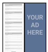
FULL PAGE 1/8" BLEED 3.8 X 10.6 4.5 X 11.25