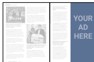
HALF PAGE NO BLEED 3.75 X 10.25