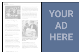
FULL PAGE 1/8" BLEED 8.375 X 10.875 8.625 X 11.125