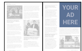
QUARTER PAGE NO BLEED 3.75 X 4.75