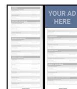
QTR. PAGE NO BLEED 3.8 X 2.125